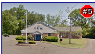
V.F.W. of Windsor Locks 36 Fairview St Windsor Locks, CT 06096