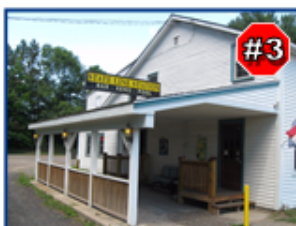
State Line Station 4 College Highway Southwick, MA 01077