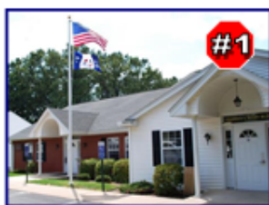
Union Hall 2 Concorde Way Windsor Locks, CT 06096

POKER HAND TALLEY SHEETS MUST BE SUBMITTED BY 3PM!