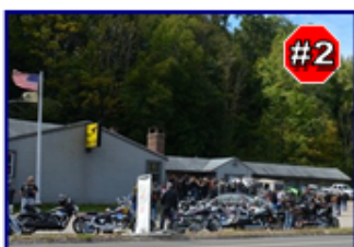
Brass Horse Cafe 87 New Hartford Road Barkhamsted, CT 06063