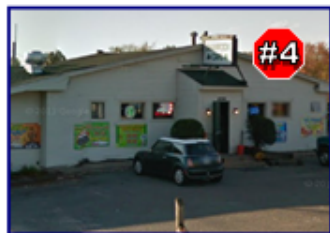
Shamrock Cafe 1117 East St Suffield, CT 06078